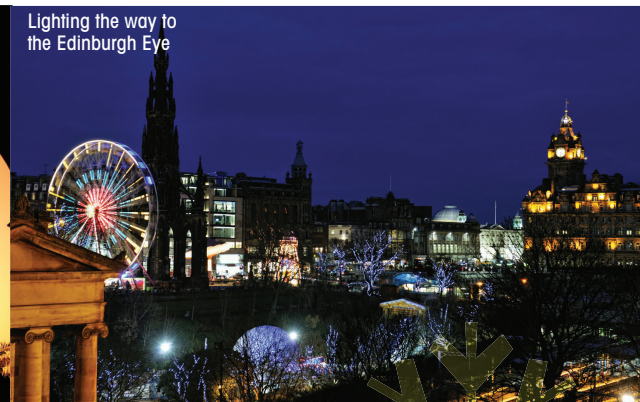
Lighting the way to the Edinburgh Eye

Where to stay: Emirates Palace Hotel ( emiratespalace.com ). Opulent, glamorous and expensive, this hotel is a palace in every sense of the word. Boasting 15 gourmet dining options, two swimming pools, an exceptional spa, gold and marble-bedecked suites, an exclusive beach, tennis courts, rugby and soccer pitches, its own marina and a helipad, it's got it all going on. Go there and spoil yourself rotten for a Christmas present to you, from you.