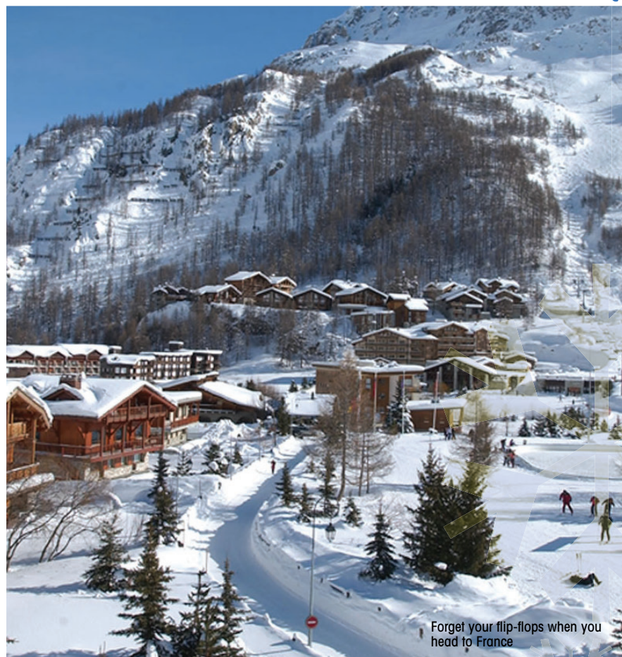
Forget your flip-flops when you head to France