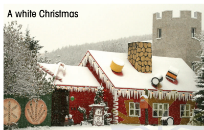
A white Christmas

How to get there: KLM flies to Reyjavik from Dhs2,040 return.