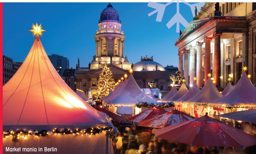
Market mania in Berlin

Where to stay: The Regent Berlin ( regenthotels.com ). Stately, über comfortable and with impeccable service: it's easy to see why this