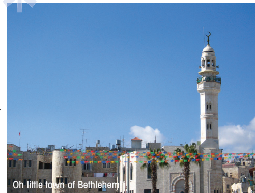
Oh little town of Bethlehem

How to get there: FlyDubai flies to Amman from Dhs895 return. From central Amman, a taxi to King Hussein Bridge should take approximately 30 minutes, while a second taxi ride from the bridge to Bethlehem should take approximately 45 minutes.