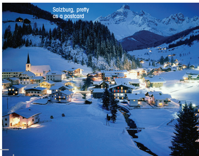
Salzburg, pretty as a postcard

How to get there: KLM flies to Edinburgh from Dhs4,419 return.