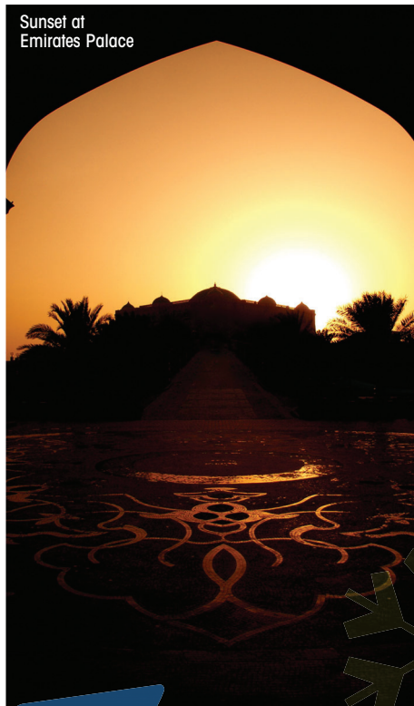
Sunset at Emirates Palace

How to get there: Austrian Airlines flies to Salzburg via Vienna from Dhs2,721 return.